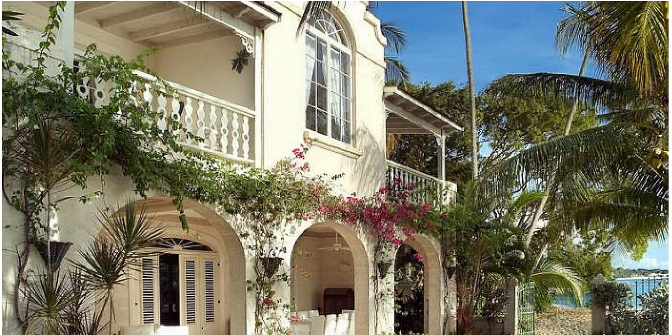
VILLA CAPRICE , 4 BEDROOMS , 3 BATHROOMS PRICE : $6,500,000