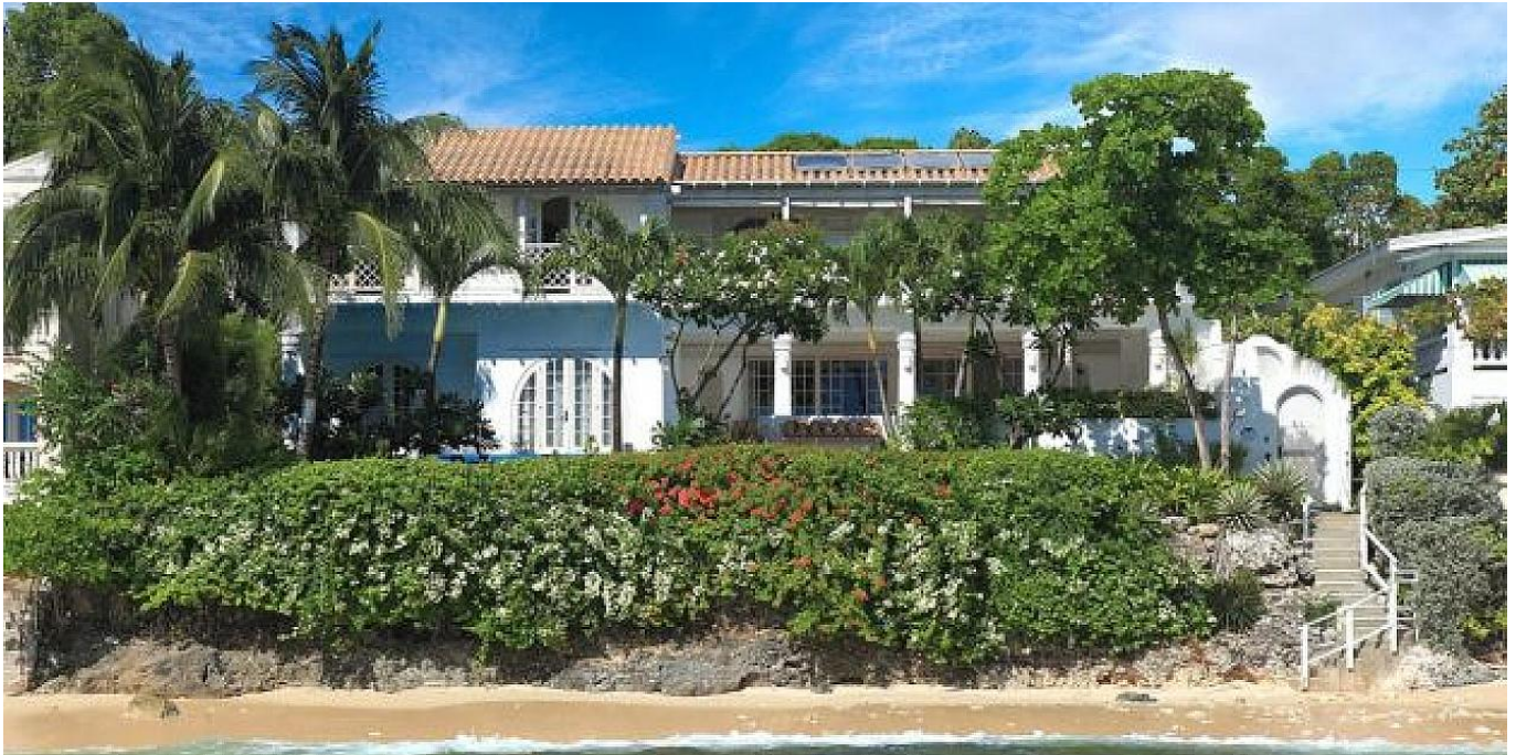
BEACHFRONT THE BEACH HUT , 6 BEDROOMS PRICE : $7,500,000