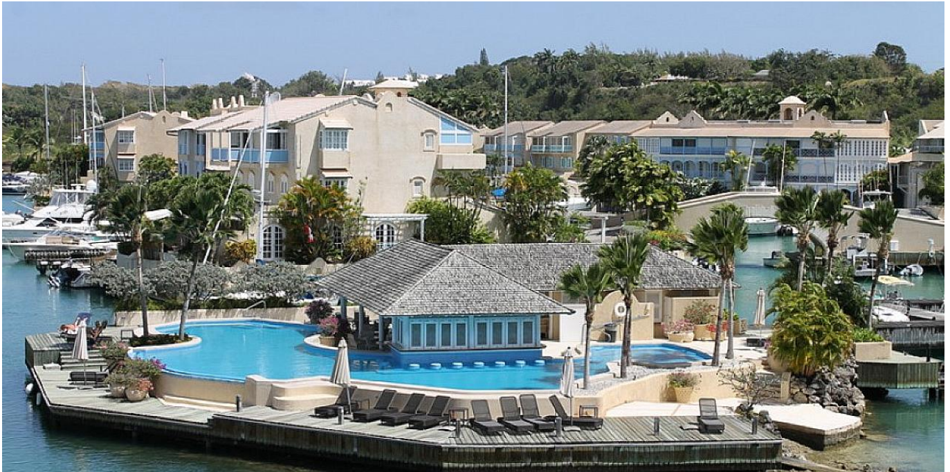
PORT ST CHARLES 364 , 3 BEDROOMS , 3.5 BATHROOMS PRICE : $1,350,000