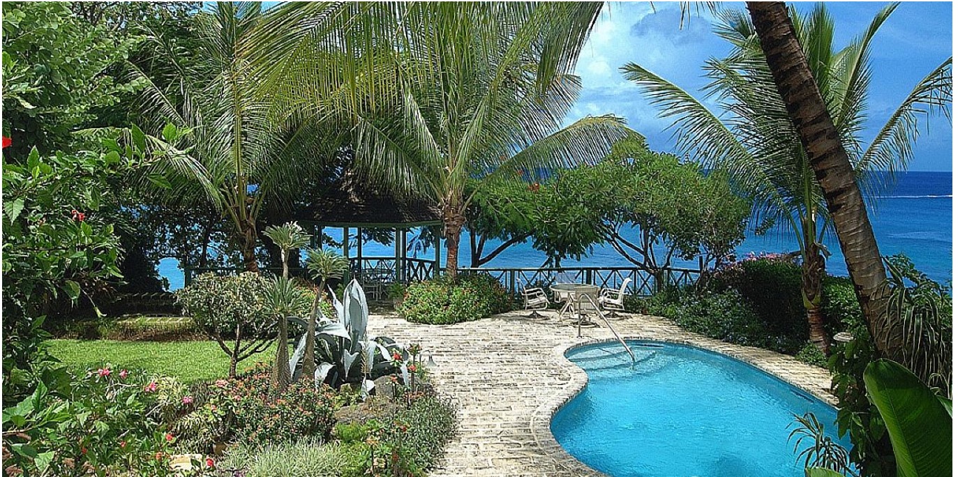
BEACHFRONT- SENDERLEA , 3 BEDROOMS PRICE : $5,500,000